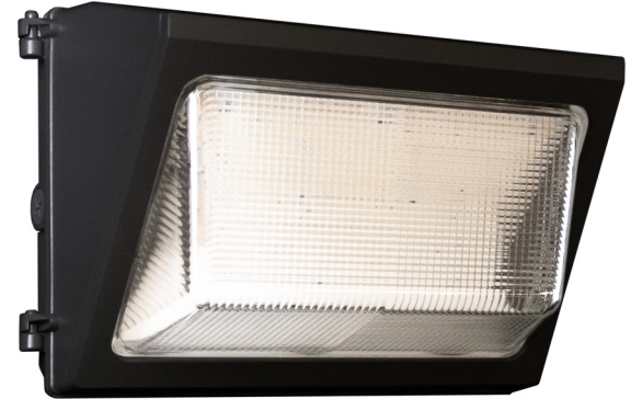
Includes Silicone Water Repellent Ring and Internal Mounting Level